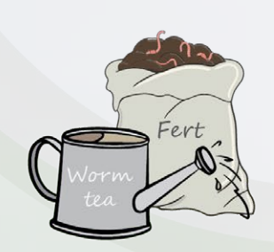
Worm castings and tea nutrients for gardens