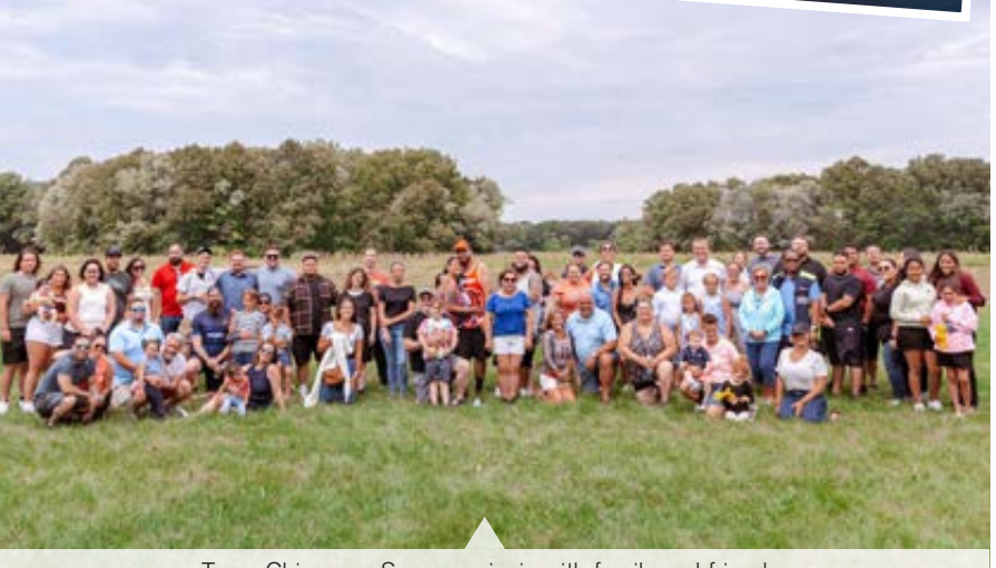
Team Chicago - Summer picnic with family and friends