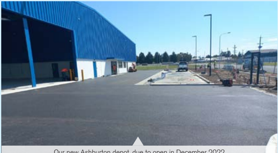
Our new Ashburton depot, due to open in December 2022

Ashburton's new 2,600m<sup>2</sup> warehouse and freight depot is purpose-built for our customers in Ashburton and Mid Canterbury. Providing network intensification is key for Mainfreight, placing us closer to customers and reducing our reliance on congested arterial routes. Mainfreight Ashburton is expected to be completed in the middle of December, with the team going live on the site before Christmas.