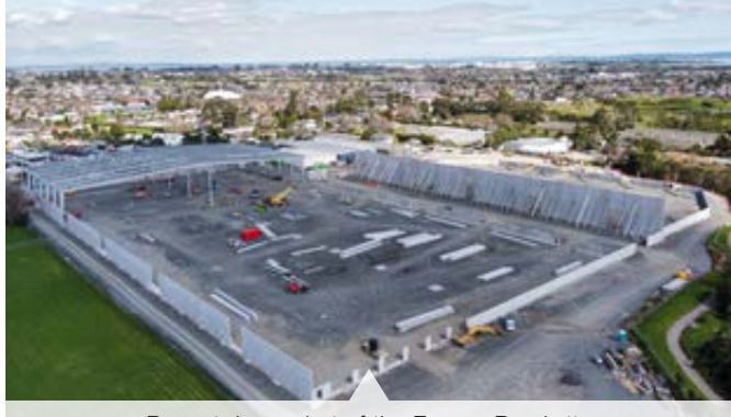
Recent drone shot of the Favona Road site

This new Auckland warehouse is progressing well. The concrete tilt slab, framing and roofing are starting to go up - delivery for Stage 1 is expected to be May 2023 and Stage 2, July 2023.