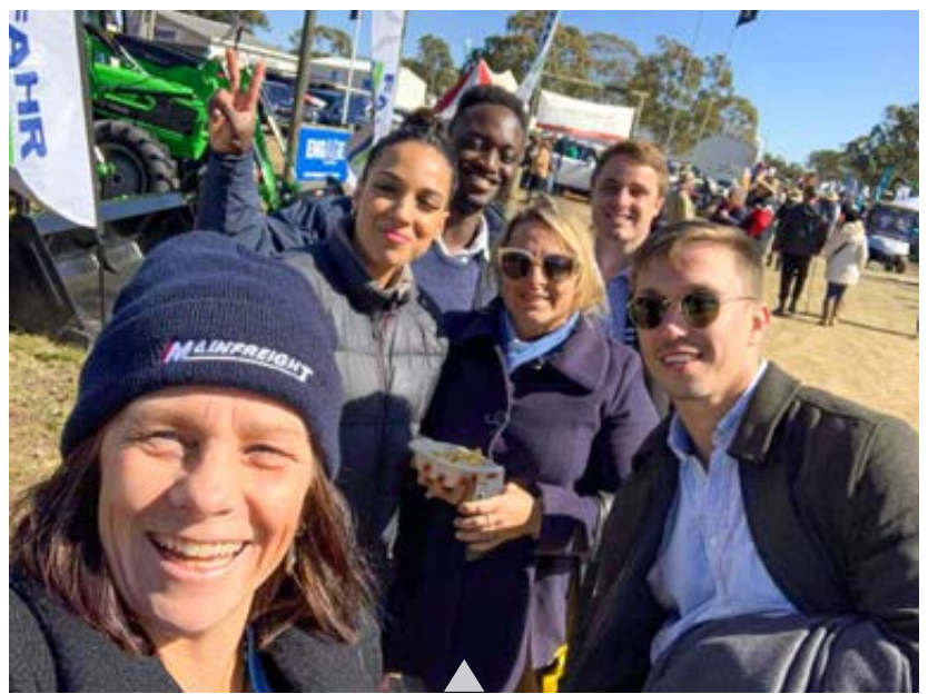
Team from around Queensland at FarmFest in Toowoomba - the largest primary industry event in Queensland