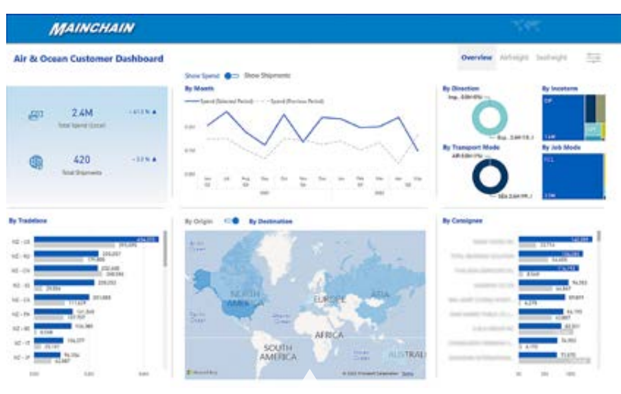
Maintel - Air & Ocean Dashboard

Improving the functionality in Mainchain, the Air and Ocean division invested in their Order Management Solution, which delivered many improvements this year.