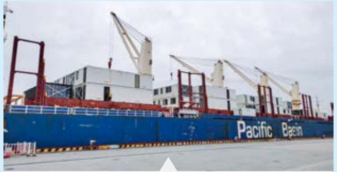
Modules ready to set sail from China

This was a great challenge; everyone stepped up and made it a success. Everyone involved should be very proud of themselves.