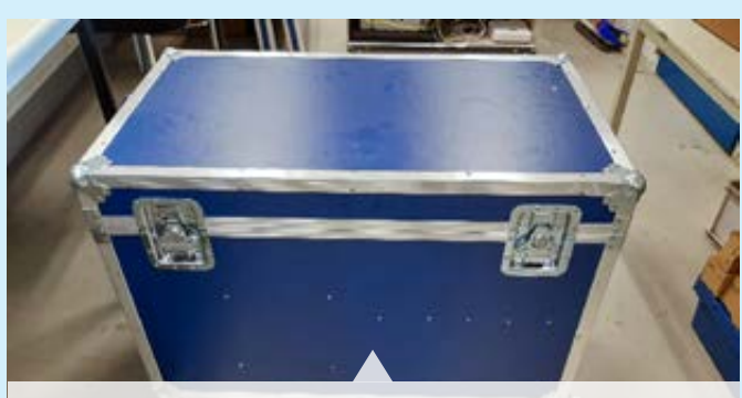
IT teams Office in a Box

We have developed an office in a box solution. An office in a box is a plug and play kit that contains everything that is needed to start up a branch, supporting up to five team members. This allows us to set up temporary and ad-hoc locations on the fly. So if things are going faster than anticipated, let's go, we are ready.