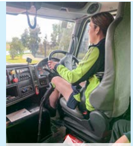
Lillian Walters behind the wheel of a big rig!

programs, load restraint, dangerous goods, and health and safety training. We will be implementing a stronger Master Loader program to assist the branches with the development and quality of our team unloading and loading our trucks to ensure we provide the best quality service possible to our customers.