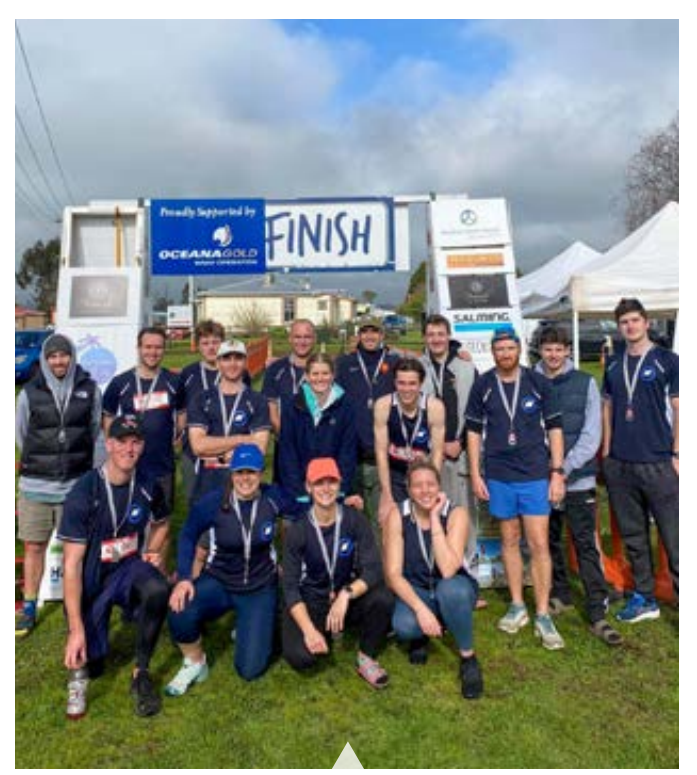
2022 Hauraki Hundee teams at the finish