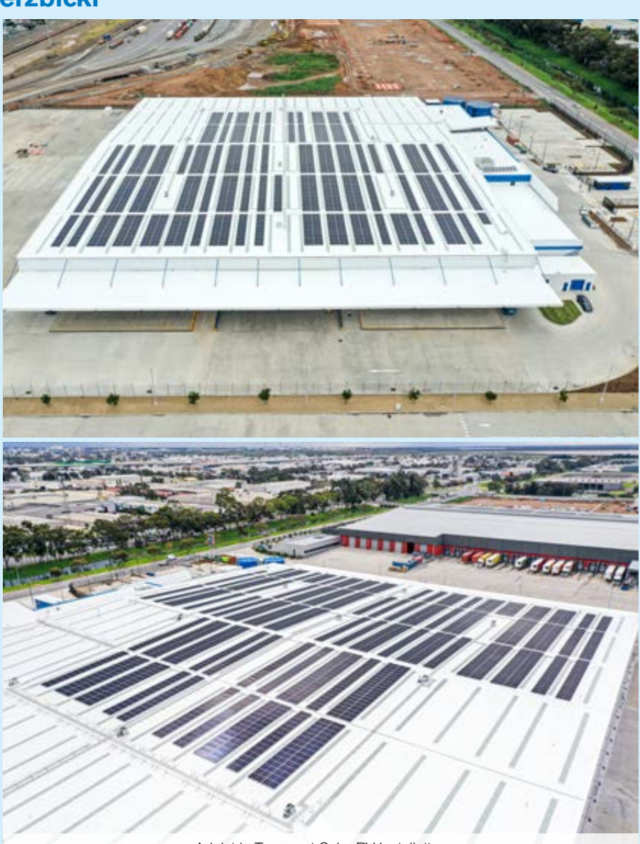
Adelaide Transport Solar PV Installation

It doesn't end there! All our new sites are fitted with smart EMS (Energy Management System) and BMS