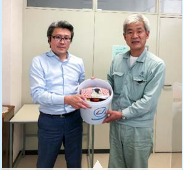
Apple bucket delivery in Japan