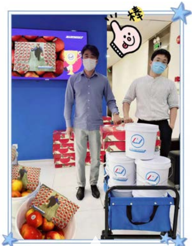
Apple delivery time – one of our favorite times of year