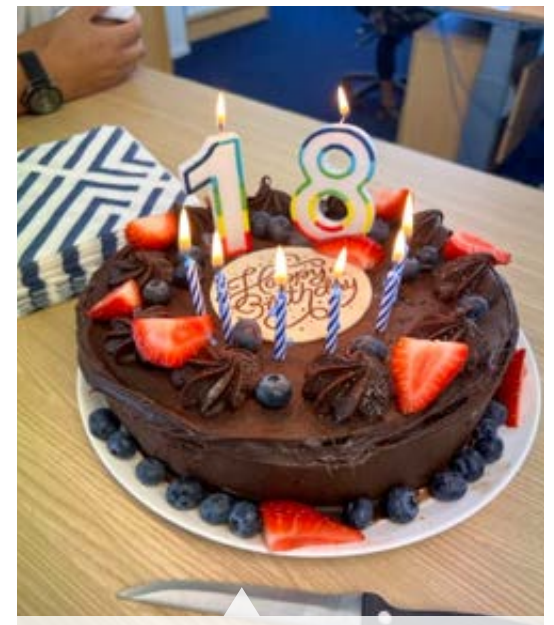
Mainfreight Air & Ocean Napier recently celebrated their 18th birthday with cake and morning tea shout for the team