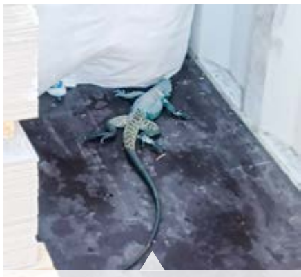
"I think I hopped on the wrong boat..."

No such thing as a free ride - there is a reason for us to take biosecurity seriously at Mainfreight, as a recent container stow-away indicates.