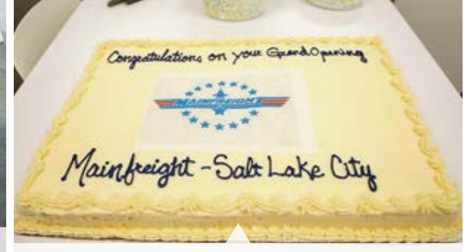
Not a celebration without cake! A&O Salt Lake City opening