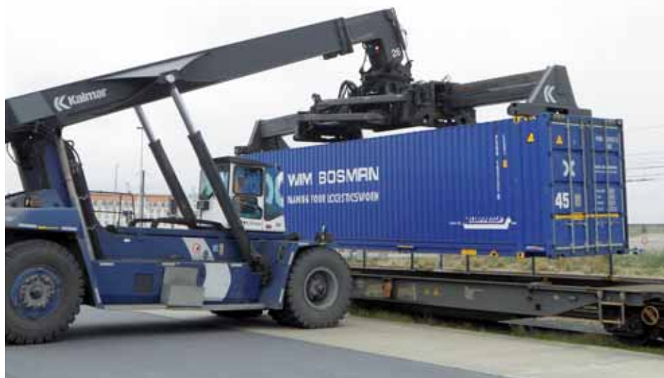
Wim Bosman Belgium starts with multimodal transport between Belgium and Italy.

Currently, test runs are taking place on a daily basis whereby a 45ft container is being transported by rail from Zeebrugge (Belgium) to Novara (Italy). Once the test phase is completed, the frequency will gradually be increased and 10 containers will be transported on a daily basis from Zeebrugge to Novara and vice versa.