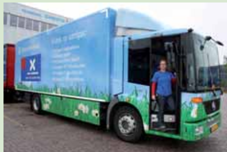
Natural Gas truck of test 2010.

We are continuously searching for improvements and possibilities to make our business operations more sustainable. For this purpose, we recently ordered the first two Mercedes Benz