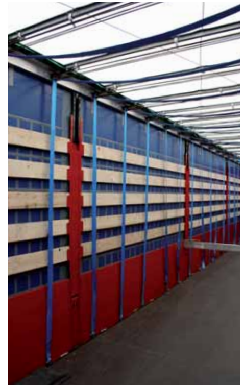
Tensioning straps in trailer 738.

In 's-Heerenberg, we have currently a fitted trailer 738 with the system. Driver Frank Medze frequently uses this trailer to transport dangerous goods to and from building Deborah, our dangerous goods warehouse. Frank explains: "The system does take some getting used to and requires a change in the sequence of loading and unloading. After a number of minor adjustments I could and would be willing to work with it full time." "It is a great system that enables you to secure goods effectively and safely in