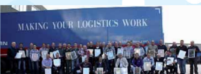
All Wim Bosman drivers who received a certificate on the 2012 driver's day.