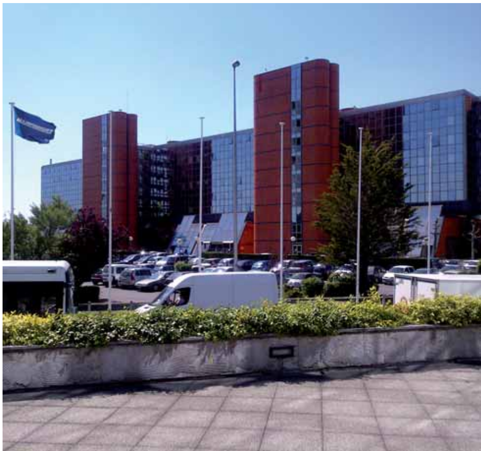
Mainfreight branch in Le Havre (France).