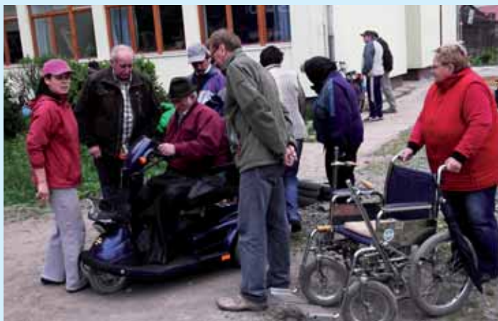
Enthusiasm during the handover of a scooter.

The Wim Bosman trailer was loaded with clothing, school furniture, walkers, beds and mattresses for a primary school, a doctor's office, a care centre for senior citizens and a refuge for unmarried mothers. The most beautiful moment was the presentation of a scooter to a disabled man, who was also given instruction on how to use it. This was made possible with the truck and trailer of the Wim Bosman Group!