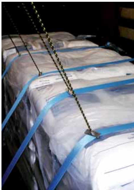
Pinned cargo through tensioning straps.

A combination of both elastic straps and special magnets ensures that the tensioning straps hang tightly in the corners, against the ceiling and walls of the trailer. As soon as the tensioning straps are pulled, they drop down from the roof and secure the load.